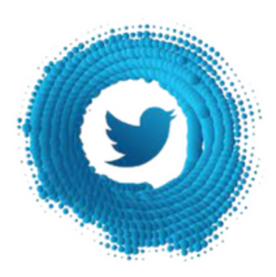
TWITTER (or X)

Follow us on social media for updates on fixtures, results and to see goals etc - also if your team has a bit of content you would like to share get in touch with us on <a href="mailto:chairman@ellersliefootball.org.nz">chairman@ellersliefootball.org.nz</a> or tag us in on your platform of choice.